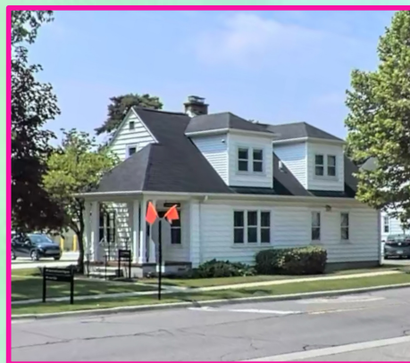
Special and Summer Programs (SSP) 21 Valley Way